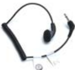
AARLN4885 Receive-only covered earbud with coiled cord for RSM.