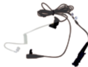
PMLN5724* 2-wire surveillance kit with quick disconnect acoustic tube, black. (also available in beige PMLN5726)