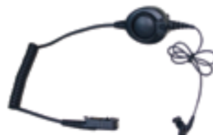
PMLN5729 IMPRES Bone Conduction Ear Microphone with in-line large push-to-talk with protective ring. Transmit in noisy environments using bone conduction.