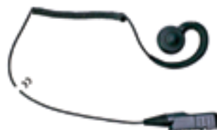
PMLN5728 Mag One Earbud with in-line microphone and push-to-talk button.