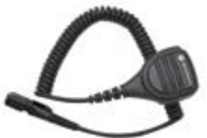
PMMN4075 Small remote speaker microphone, windporting, IP57. No emergency button.