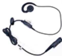
PMLN5727 Mag One swivel earpiece with in-line microphone and push-to-talk.