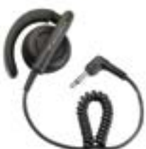
WADN4190 Receive-only flexible earpiece for RSM.