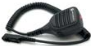
PMMN4072 IMPRES large remote speaker microphone with noise-canceling microphone, louder audio, audio jack and emergency button, IP54.

Get the most out of your MTP3000 Series radios by extending its power and reliability with Motorola certified accessories. This includes select 3rd party accessories that have been tested and certified with the MTP3000 Series radios. Our accessories endure rigorous testing to help keep you safer.