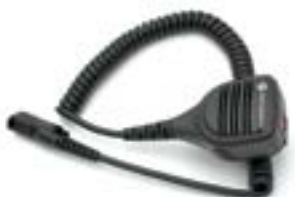
PMMN4078 Small remote speaker microphone with audio jack and emergency button, windporting, IP55.