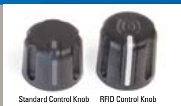
Standard Control Knob RFID Control Knob

◀ Optional colour identification bands for groups with different tasks, coverage areas or shifts