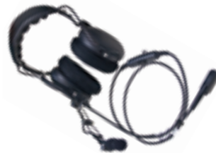
PMLN5731* Dual-muff over the head headset with boom microphone and in-line push-to-talk, 24dB noise reduction rating.