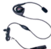
PMLN5732* Mag One lightweight earset with boom microphone and in-line push-to-talk.